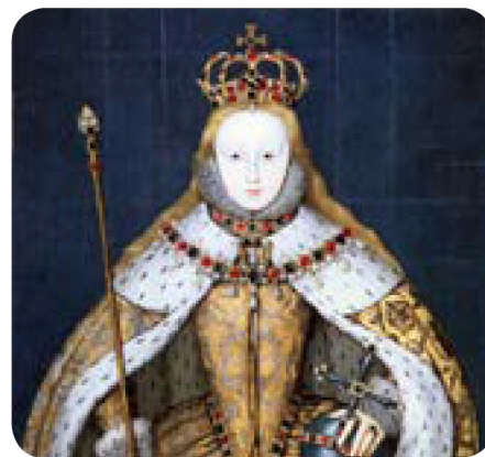
Coronation Portrait by unknown artist, c1600