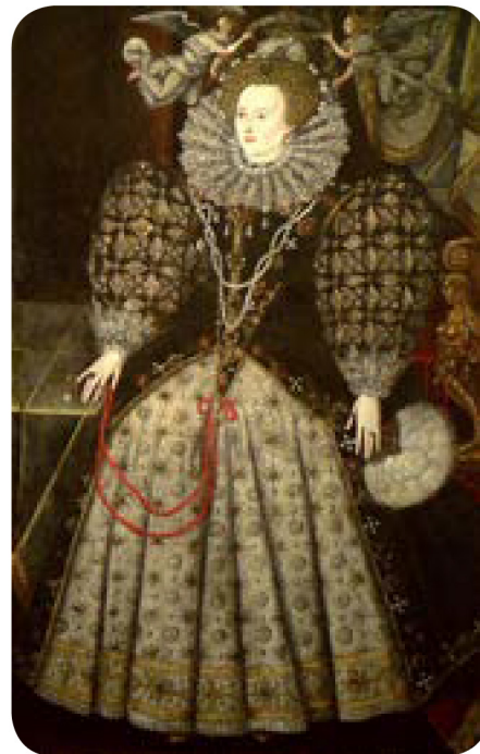
Portrait of Elizabeth I of England attributed to Nicholas Hilliard, 1590