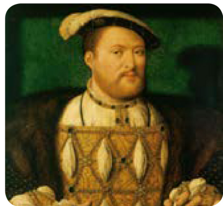
Portrait of Henry VIII by Joos van Cleve, c1530–1535

A portrait is a painting or photograph of a person. It usually shows their head and shoulders, but may show their whole body. Before cameras were invented, kings and queens often had official portraits painted to show how powerful and important they were.