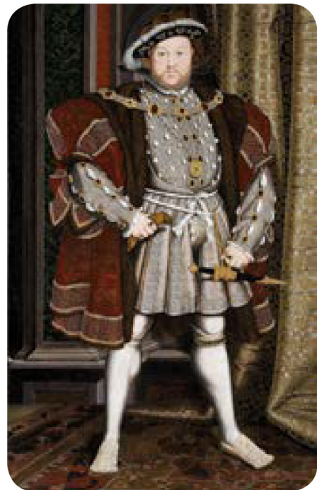
Henry VIII by Hans Holbein the Younger, 1537–47